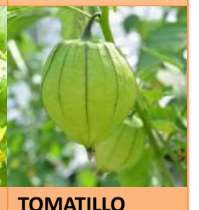
Grande Rio Verde Husk tomato; high yielding; firm, round fruit; excellent flavour.