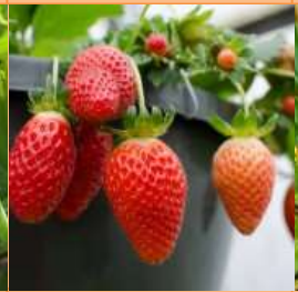
STRAWBERRY Berries Galore Ever-bearing; early blooming; midsized red berries; premium flavour.