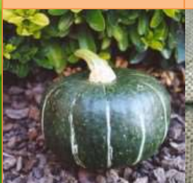
SQUASH Winter Buttercup Burgess Thin, hard rind; fiber free; quality fruit that holds.