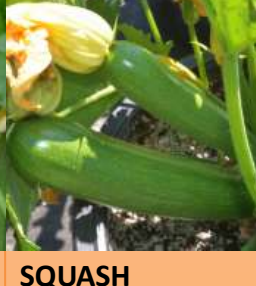
Zucchini Noche F1 Very dark green fruit; good yields all season long.