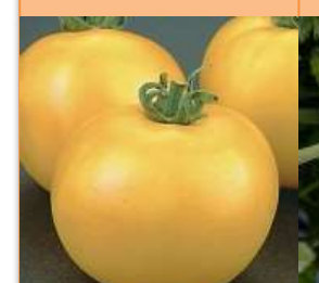
TOMATO Lemon Boy

Early maturing and large sweet fruit. Resistant to races of late blight.