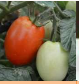
TOMATO La Roma

Productive; super sweet; 1.5" grapeshaped fruit.