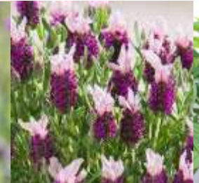
LAVENDER Bandera Pink

Compact habit with good branching and uniformity; flowers all season.