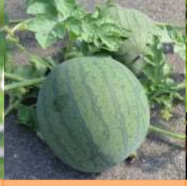
WATERMELON Sugar Baby

3" deep red fruit; plum; best paste tomato. Staking.