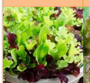
LETTUCE Gourmet Salad Blend

Highly decorative; curly blue-green fringed leaves.