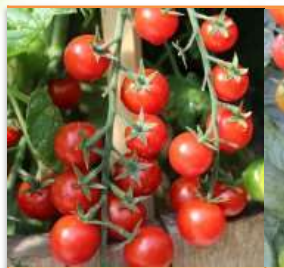
TOMATO Sweet 100

Popular; very sweet; small 1" red fruit. Staking needed.