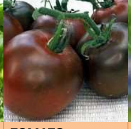
TOMATO Heirloom, Black Prince

Deep purple-black, 1" tomato; excellent taste. Staking needed.