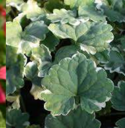
GLECHOMA Emerald Frost Distinctive and fragrant foliage. Perfect trailer for mixed planters and baskets.