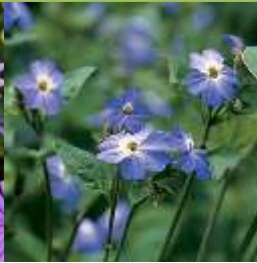
BROWALLIA Sapphire Blue True blue flowers with white eye. Perfect for back border plantings. Sun/partial shade.