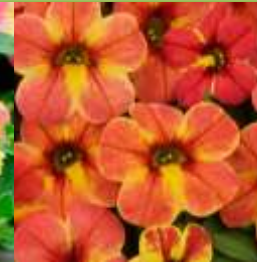
CALIBRACHOA CHAMELEON Indian Summer Ever changing colour display of orange and yellow tones all season.