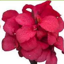
CANNA LILY CANNOVA

Perfect for mixed containers and garden beds. Sun. Green foliage.