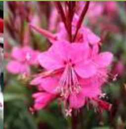
GAURA - BELLEZA Cynthia Beautifully airy, butterfly-like flowers. Heat and drought tolerant.