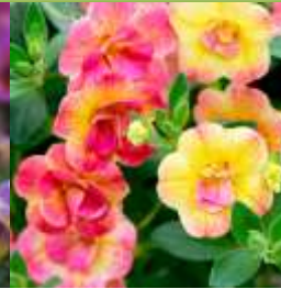
CALIBRACHOA CHAMELEON Double Pink and Yellow Double blooms. Ever changing colours all season.