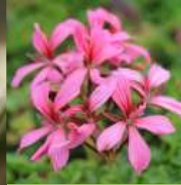
GERANIUM - CLIO Cascading Pink Flowers continuously all summer. Attracts butterflies.