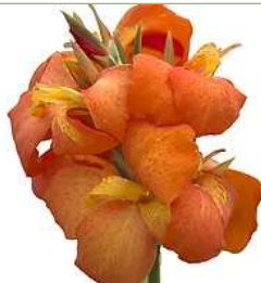
CANNA LILY CANNOVA

Perfect for mixed containers and garden beds. Sun. Bronze foliage.