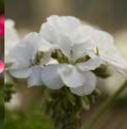
GERANIUM - CALLIOPE White Premier series. Prized for its large flower heads and fancy leaves.