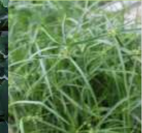
GRASS Cyperus Umbrella Excellent for accent and structure plant. Adds height.