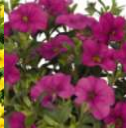
CALIBRACHOA - SWEET CHIMES Raspberry Compact trailing habit and prolific bloomer. Medium pink colour.