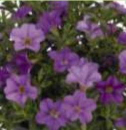
CALIBRACHOA - SWEET CHIMES Blueberry Compact trailing habit and prolific bloomer. Great in mixed planters.