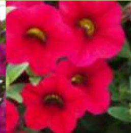
CALIBRACHOA - SWEET CHIMES Red Wine Compact trailing habit and prolific bloomer. Deep red colour.