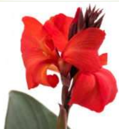
CANNA LILY CANNOVA