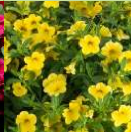
CALIBRACHOA - SWEET CHIMES Lemon Zest Compact trailing habit and prolific bloomer. Vibrant yellow colour.