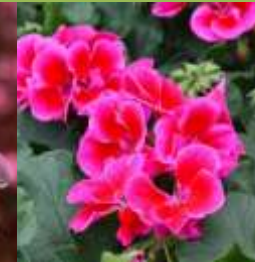
GERANIUM - CALLIOPE Crimson Flame Premier series. Prized for its large flower heads and fancy leaves.