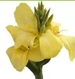
CANNA LILY CANNOVA

Perfect for mixed containers and garden beds. Sun. Green foliage.