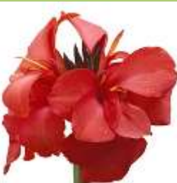
CANNA LILY CANNOVA

Perfect for mixed containers and garden beds. Sun. Green foliage.