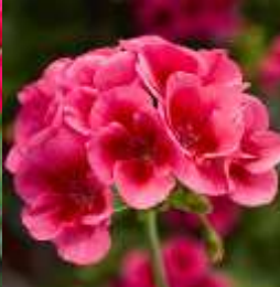
GERANIUM - CALLIOPE Rose Mega Splash Prized for its large flower heads and fancy leaves.