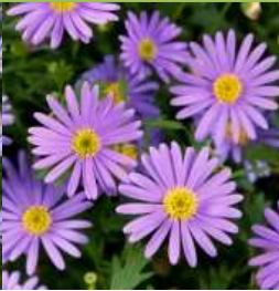
BRACHYSCOME Virginia Violet Purple daisy-like blooms and yellow centers. Frilly foliage. Semi-trailing habit.