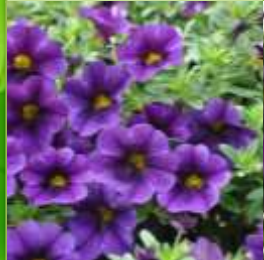
CALIBRACHOA - SWEET CHIMES Blackcurrant Compact trailing habit and prolific bloomer. Beautiful dark blue colour.