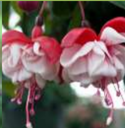
FUCHSIA Swing Time Perfect for hanging baskets, mixed containers, and window boxes.