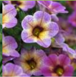
CALIBRACHOA CHAMELEON Blueberry Scone Ever changing colour display of purple and yellow tones all season.