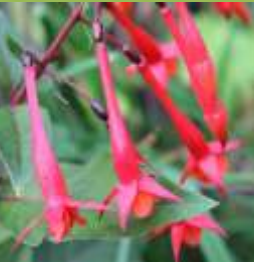
FUCHSIA Insulinde Upright habit makes it the perfect thriller for patio containers.