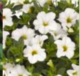
CALIBRACHOA - SWEET CHIMES Snowberry Compact trailing habit and prolific bloomer. Goes with all colours.