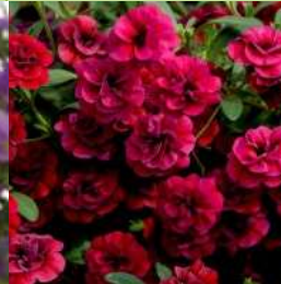
CALIBRACHOA - SWEET CHIMES Cherry Compact trailing habit and prolific. Double dark red flowers.