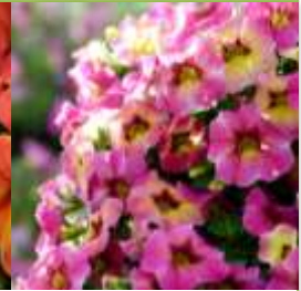
CALIBRACHOA CHAMELEON Lemon Berry Ever changing colour display of pink and yellow tones all season.