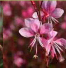
GAURA - BELLEZA Olivia Beautifully airy, butterfly-like flowers. Heat and drought tolerant.