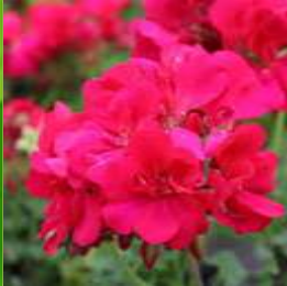
GERANIUM - CALLIOPE Hot Pink Premier series. Prized for its large flower heads and fancy leaves.