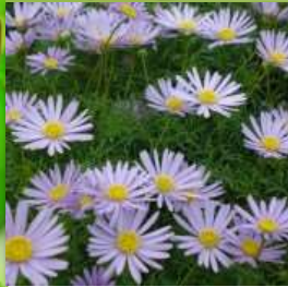
BRACHYSCOME Oregon Blue Dainty daisy-like blooms and feathery foliage. Compact mounding habit.