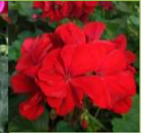
GERANIUM - CALLIOPE Dark Red Premier series. Prized for its large flower heads and fancy leaves.