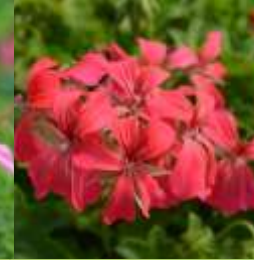
GERANIUM - CLIO Cascading Red Flowers continuously all summer. Attracts butterflies.