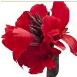
CANNA LILY CANNOVA

Perfect for mixed containers and garden beds. Sun. Bronze foliage.