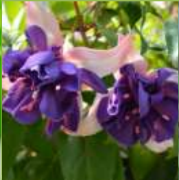
FUCHSIA Deep Purple Perfect for hanging baskets, mixed containers, and window boxes.