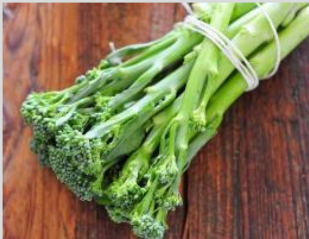
Aspacroc F1 (Broccolini)