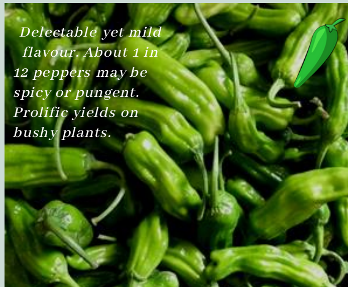
Togarashi Shishito Pepper

Delectable yet mild flavour. About 1 in 12 peppers may be spicy or pungent. Prolific yields on bushy plants.