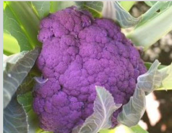
Graffiti F1 Cauliflower

Medium-sized (2lbs) cauliflower variety that stands out.