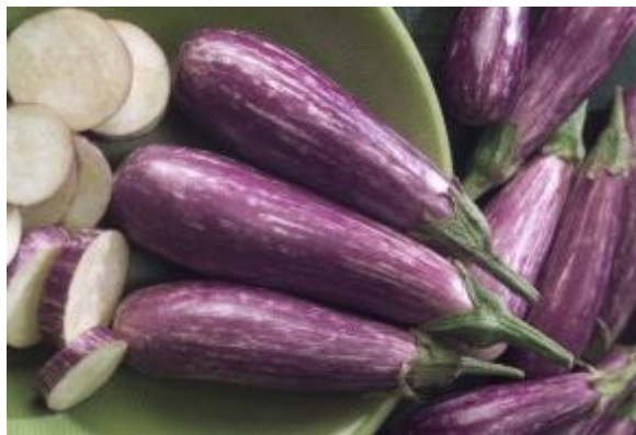
Fairy Tale Eggplant