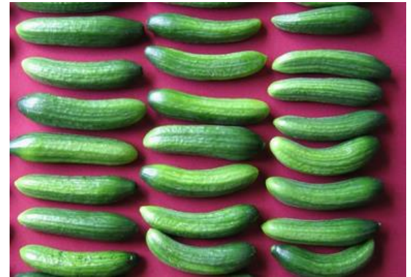
Adam F1 Cucumber