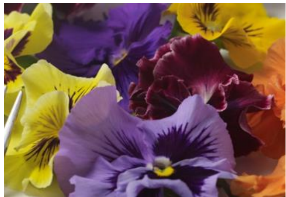
Tasteful Mix Viola