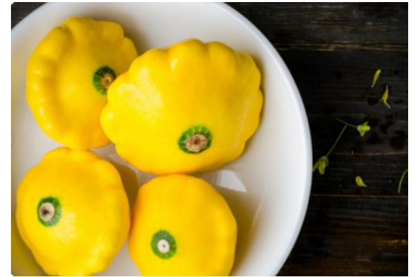
Lemon Sun Patty Pan Squash