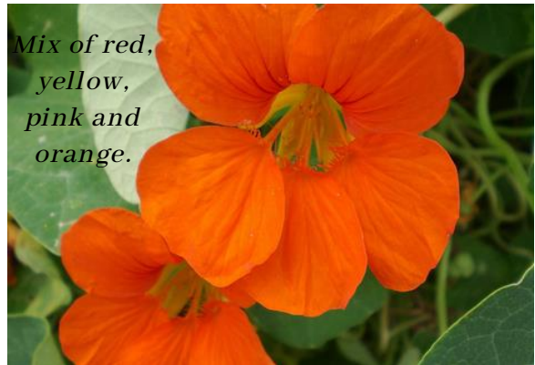
Jewel Mix Nasturtium