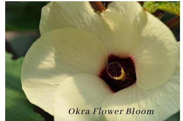
Okra Flower Bloom