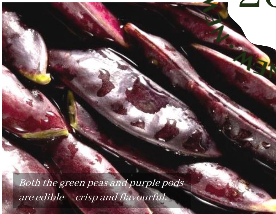
Royal Snap II Peas