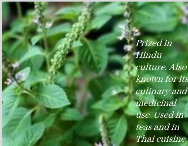
Holy Basil (Tulsi)

Prized in Hindu culture. Also known for its culinary and medicinal use. Used in teas and in Thai cuisine.