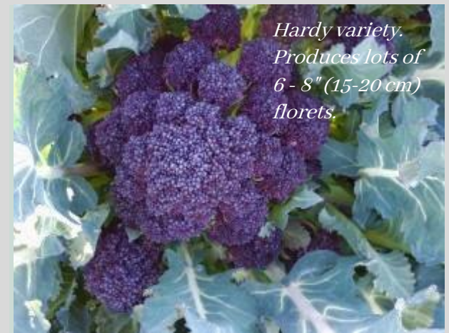
Red Fire F1 Sprouting Broccoli

Young cucumber-flavoured leaves are tasty in salads and drinks.