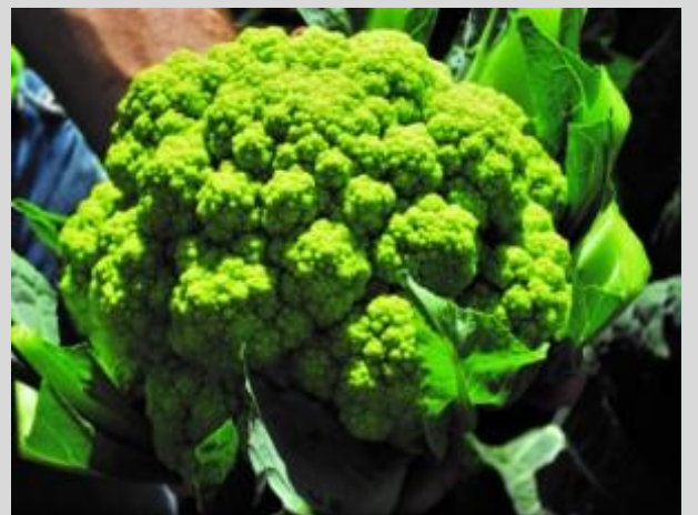
Vitaverde F1 Cauliflower