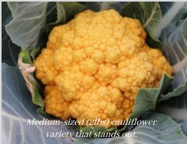
Cheddar F1 Cauliflower

Hardy variety. Produces lots of 6 - 8" (15-20 cm) florets.