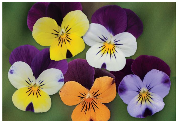
Jazzy Johnny Jump Up Mix Viola