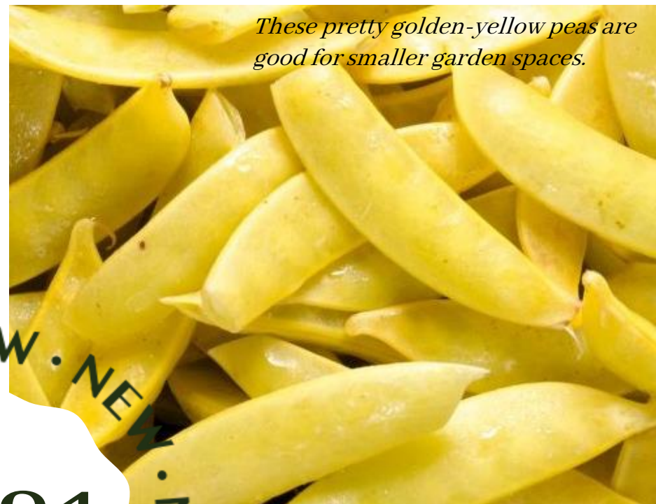
Honey Snap II Peas