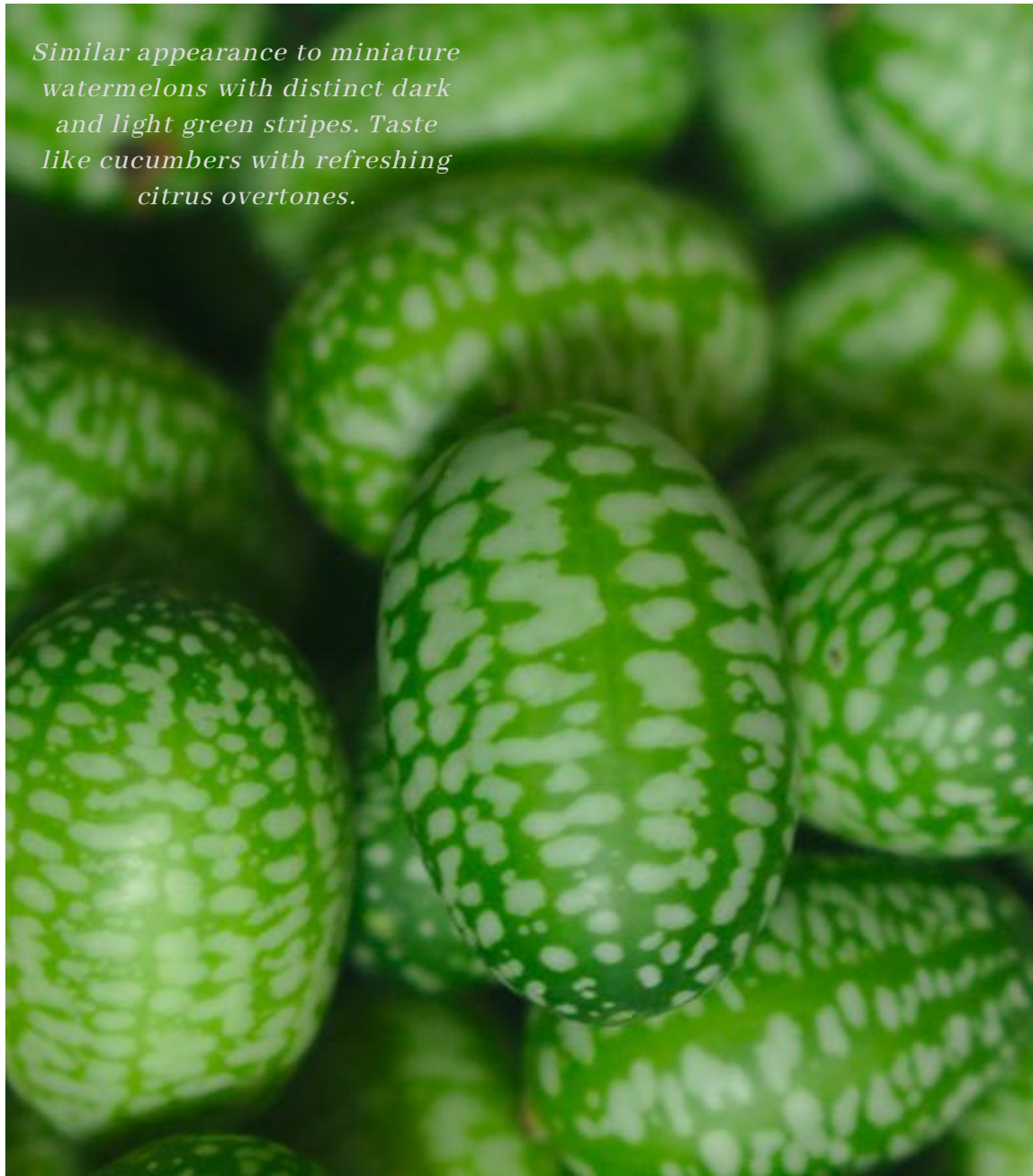
Cucamelon (Mexican Sour Gherkin)

Similar appearance to miniature watermelons with distinct dark and light green stripes. Taste like cucumbers with refreshing citrus overtones.