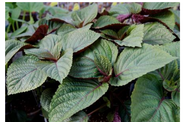
Britton Shiso (Perilla)