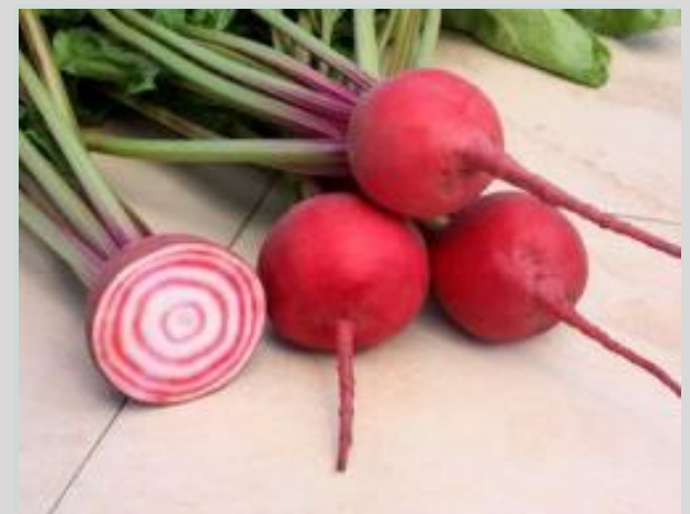
Chioggia Guardsmark Beets

Prized in Hindu culture. Also known for its culinary and medicinal use. Used in teas and in Thai cuisine.