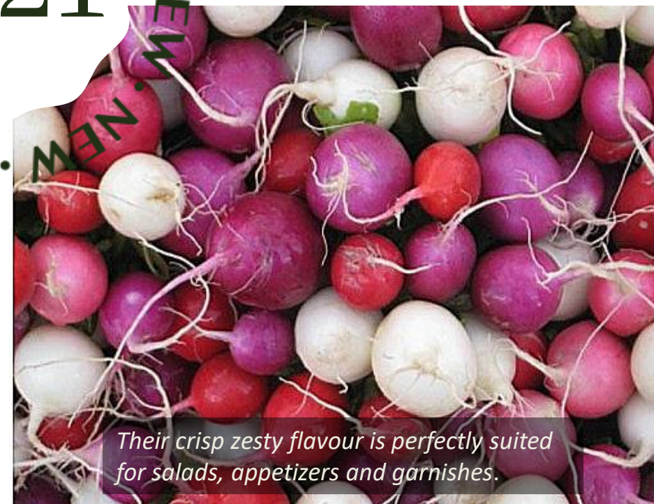
Colourful Mix Radish

Gorgeous watermelon-type radishes with crisp and juicy texture.